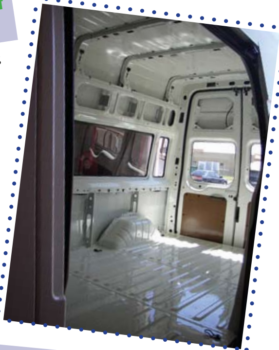
This is what it looks like inside the van now

Use the blank sheet to design your own van. You might want to draw the inside or the outside, or both. Use crayons or other materials you may have - go for it!